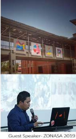
Guest Speaker- ZONASA 2019